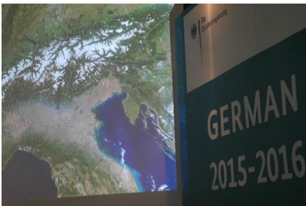
Photo: Alpine Soil Symposium Source: blue! advancing european projects GbR

However, the participants also drew attention to major gaps in knowledge of the content of the Protocol and its integration into administrative practice. There are particular problems with Articles 20 and 21, which concern the establishment of harmonised databases and coordination of monitoring. There was also an urgent call for regular dialogue with all soil conservation stakeholders in order to share best practice and benefit from the experience gained by other experts and countries, for example. It is also important to raise awareness of soil conservation in the Alps among all stakeholder groups. This may be a matter for the soil protection forum called for by participants.