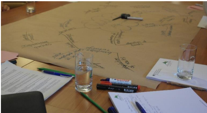
Photo: World-Café outcomes Source: blue! advancing european projects GbR

The main outcomes of each of the four World-Café sessions are summarised in a short report below.